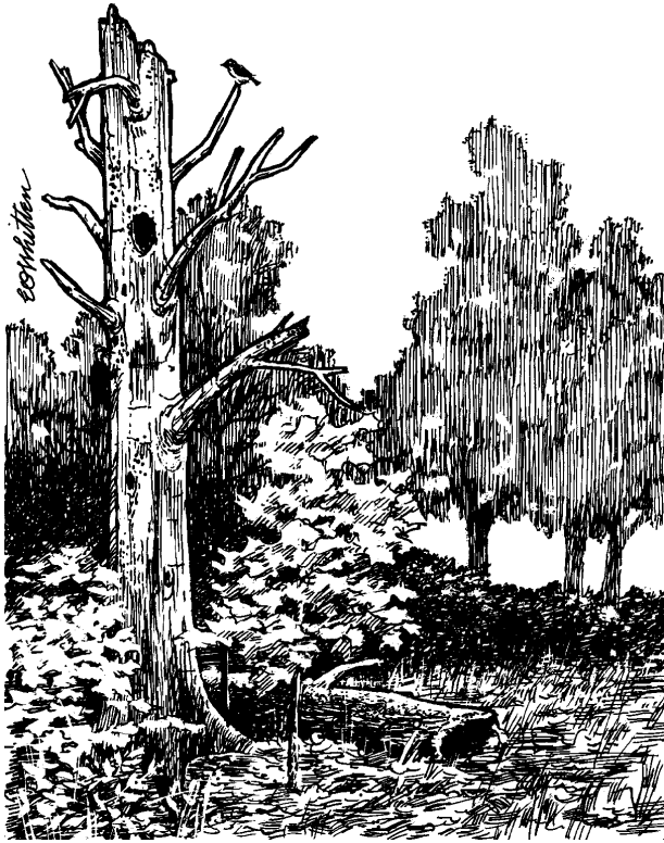
Figure 2. A snag

ing many cavities. Beech and sycamore make ideal wolf trees and should be protected and encouraged within a woodland area or in connecting fencerows.