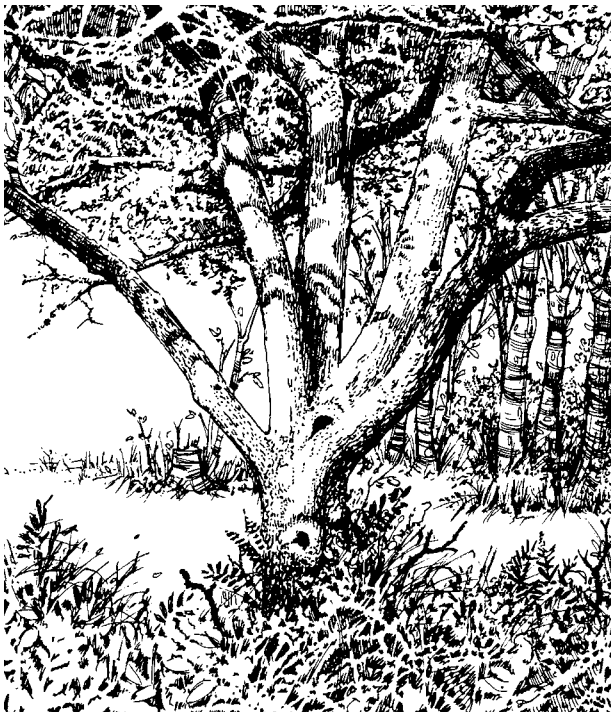
Figure 3. Wolf tree

It is equally important to preserve large quantities of woody ground debris such as fallen trees and decaying logs and stumps. These structures are used by woodland salamanders, snakes, and turtles.